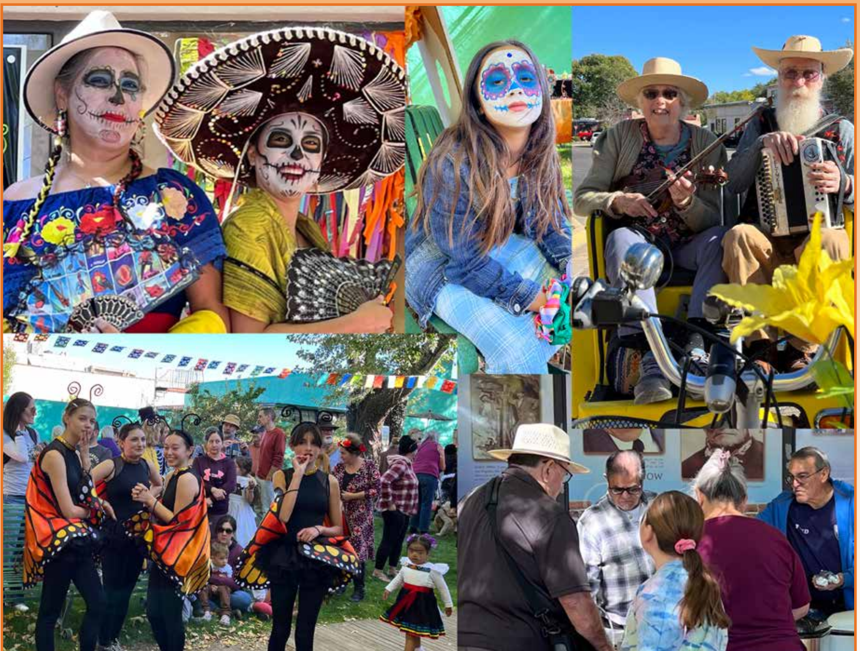
The revived festival had a great crowd celebrating loved ones who have passed. Mark your calendar for next year's festival, parade, and blessing of the ofrendas, November 1st and 2nd.