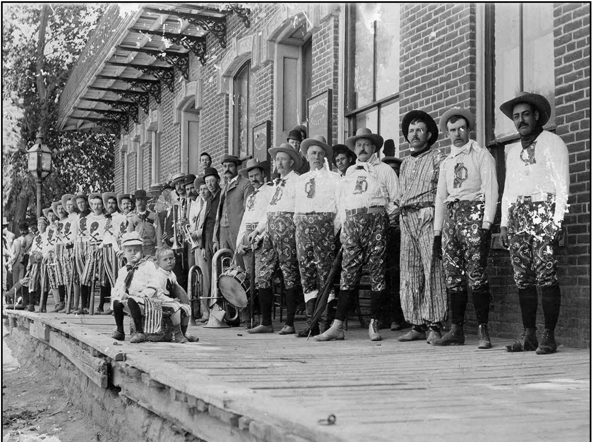
The “Slims and Fats” photographed in downtown Silver City, with their fanciful uniforms in full display. circa 1880s.

In 2020, burlesque baseball was revived for a special Territorial Charter Day event. Advertisements for the game announced a goofy, goodwill game with different rules. “Costumed players win drink tickets rounding bases in reverse order, skipping instead of running, and performing a required victory dance when they catch a pop fly.” Once again, the game was a massive hit, highlighting a fun and easy way to honor Silver City’s unique heritage and traditions.