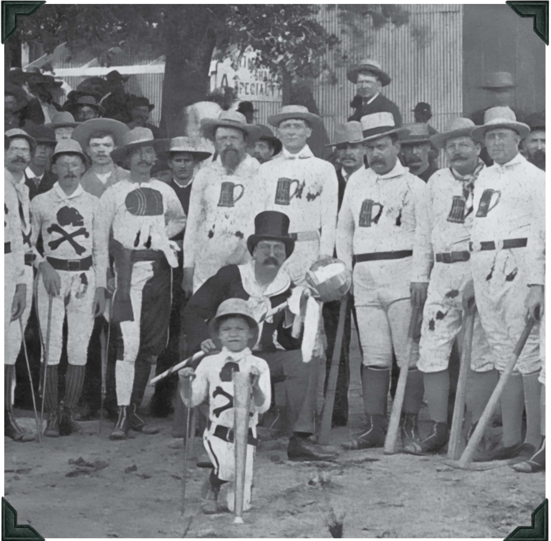
"Slim Jims" on left, umpire and "Fat Fellows" on right. Photo taken at Yankie and Main Streets circa 1888. Silver City Museum photo #15590.

The Quarterly Publication of the Silver City Museum Society